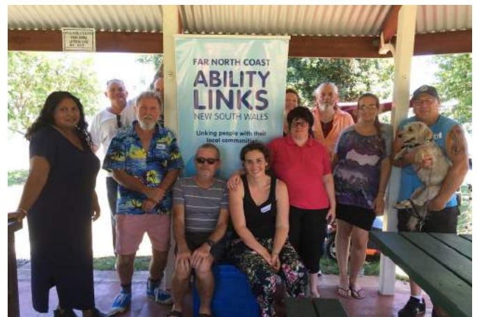
Kyogle Peer Support Group

Remember, donations above $2 are fully tax deductible.