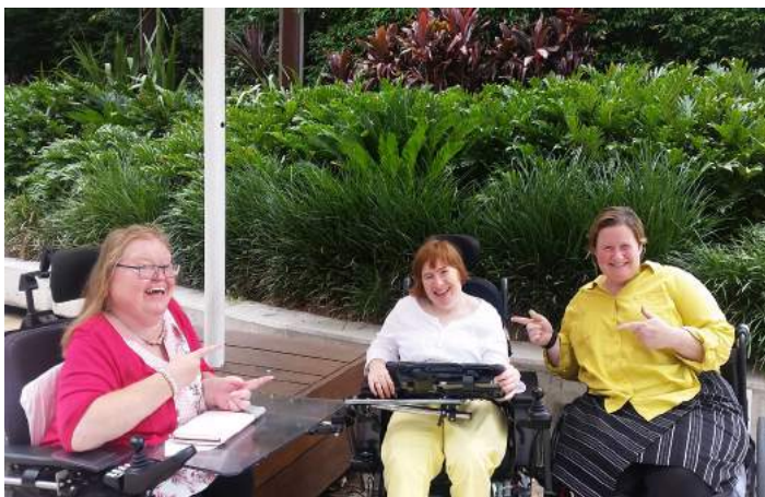
Top Ryde Peer Support Group